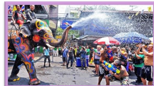
People having a water fight with an elephant during the Songkran Festival.

Every year on April 13th there is a festival in Thailand called "Songkran Water Festival" to celebrate the New Year in the Buddhist calendar. People use water to 'wash away' the old year. This is why the festival's nickname is Water Festival. Many people cleanse with water during this Festival. They also pour water over Buddha statues. People do water fights for fun, and even elephants can join!