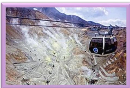
The Hakone Ropeway going over the sulfur vents next to Owakudani station.

Did you have a fun Spring break? The cherry blossoms bloomed very early this year. My friends and I took pictures with the cherry blossoms at Hayakawa River near Hakone-Yumoto station. There are many trees blooming along the river. It was very beautiful.