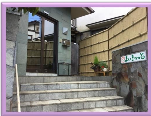
This is the entrance of the hotel, it is a very relaxing hotel with lots of nature around the area.

There is a hotel where you can live with cats for one day. The cat hotel is called まいきゃっと (My cat) in Yugawara. It is an eight minute walk from the train station. I stayed at the cat hotel for one night with other English teachers. You can buy a 'cat rental'. You can bring cats to your room and sleep next to them. We had two cats sleep in our room, Milk and Mary.