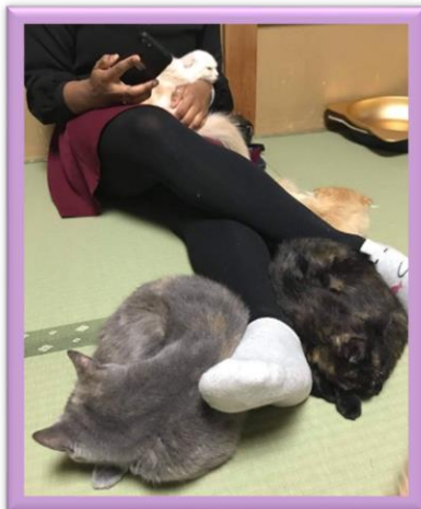
This is my friend with 4 cats in the cat café. Can you find all of the cats?

yen for one hour in the cat café, so it is a very good price. The cats are friendlier in the cat café than in the rooms because the café is their home, so they will want to hug and sit on you. There are 19 cats in total, so you will have many cats to play with. This hotel wants people to learn more about cats. The hotel wants people to know more about owning a cat so they are ready when they buy their own cat. If you love cats, or are thinking about buying a cat, please come visit My Cat Yugawara first!