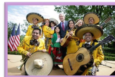
President Bush with a mariachi band during Cinco de Mayo in America.

Cinco de Mayo is a Mexican holiday. It means "Fifth of May" in Spanish. Many people perform music and traditional dances as a celebration of Mexico's win in the Battle of Puebla.