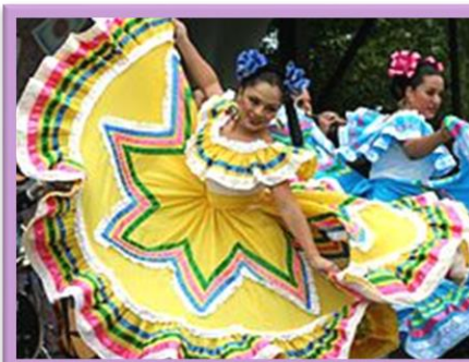
Cinco de Mayo dancers in Washington DC.

Soon after the battle, Mexico was freed from France. This holiday is very popular in America. Many people celebrate by listening to Spanish music and drinking Spanish beer.