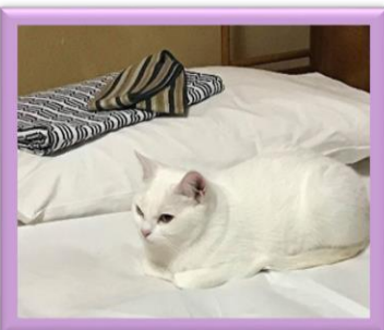
The left picture is Milk sitting on my lap, and the right picture is Mary sitting on the bed in our room.

yen for one hour in the cat café, so it is a very good price. The cats are friendlier in the cat café than in the rooms because the café is their home, so they will want to hug and sit on you. There are 19 cats in total, so you will have many cats to play with. This hotel wants people to learn more about cats. The hotel wants people to know more about owning a cat so they are ready when they buy their own cat. If you love cats, or are thinking about buying a cat, please come visit My Cat Yugawara first!