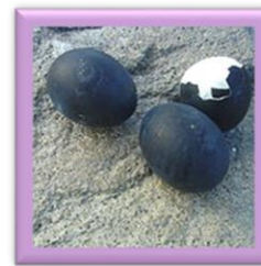
Owakudani black eggs

It smells very strongly of eggs and the ground is green because of the sulfur. It's an amazing view. There are many shops and interesting foods at Owakudani. The most famous food is the black egg. They are cooked in the volcano and the sulfur turns the eggshells completely black. If you eat the black egg, you will live seven years longer.