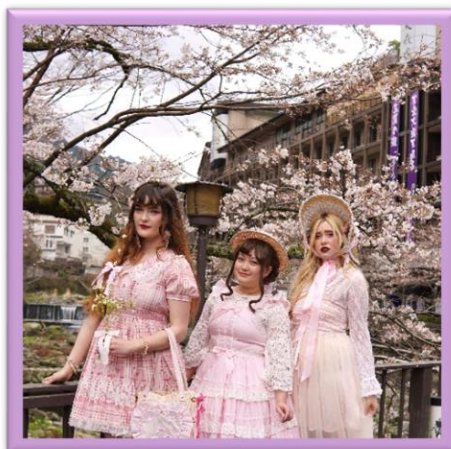
My friends and I in front of a big sakura tree along Hayakawa River in Hakone-Yumoto.

We also took the Hakone ropeway up to Owakudani Station. Have you ever been to Owakudani? It is a train station on top of a volcano. I was so surprised when I saw the sulfur vents coming out of the mountain! The ropeway car is right above the vents.